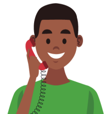
Winter Phone a Friend

We will be setting up the Christmas Fayre on the evening of the 15th November, so any strong and willing hands will be most gratefully received.