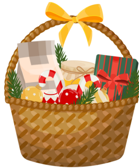
Christmas Hamper Making