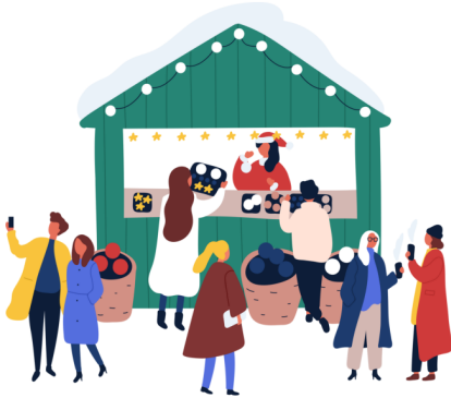
Christmas Fayre Saturday 16th November

Activities that need supporting - please contact Michelle to discuss