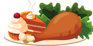
White Swan Christmas Lunch Date TBC