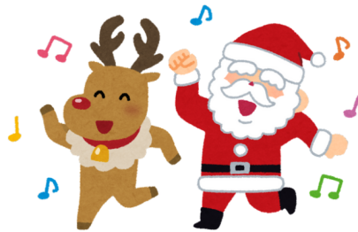
Members' Christmas Party Monday 9th December