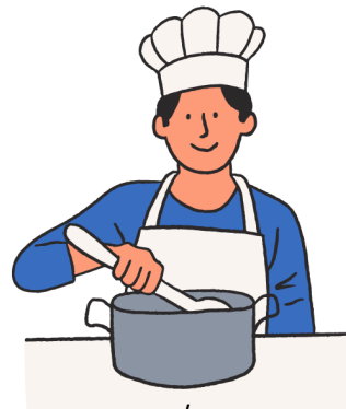
Cook/Deliver Christmas Day Dinner